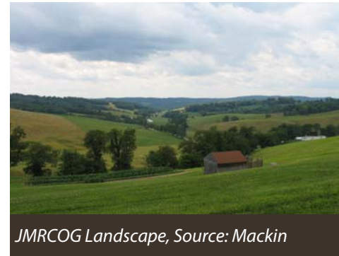
JMRCOG Landscape

The Jefferson Morgan Regional COG is an excellent model of regional cooperation and planning that without funding assistance, would not have been possible. The municipalities were able to realize a cost savings by planning together and directing growth and development to areas that are adequately served by infrastructure.