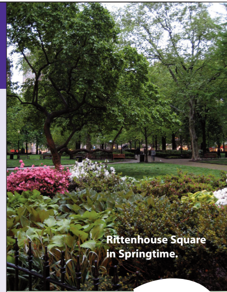
Rittenhouse Square in Springtime.

Additionally, an added benefit to this year's Conference is the presence of Fenway Park and the start of Major League Baseball's 2011 season. The Tampa Bay Rays will be in town for a 3-game series, beginning Monday night. Tickets are available as low as $29. Groups of tickets are available and can be a great way for professional planners and students to interact in a unique way, building off the mobile workshop earlier in the day regarding TOD and Sports . ♦