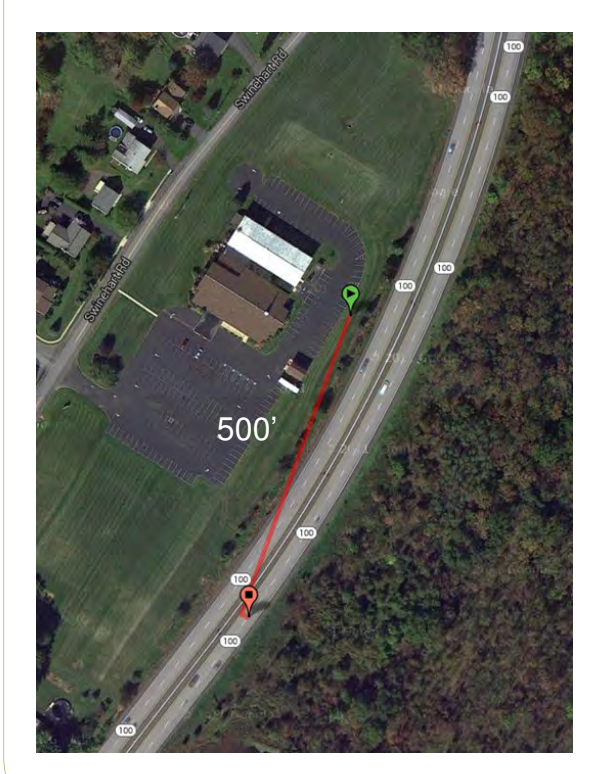
Example A: Posted Speed Limit of 35 MPH

5. The minimum message duration for this sign is 10.6 seconds.