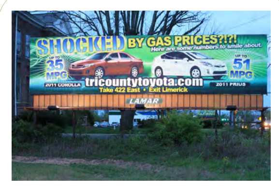
A 36' x 10.5' billboard located along Ridge Pike in Limerick Township, where the speed limit is 45 mph. Under the regulations contained in the model ordinance, a billboard this size, 378 sq. ft., would not be permitted in this setting.

Research undertaken by the United States Sign Council (USSC) utilized these five variables to develop an algebraic equation for determining the area of a sign. The equation assumes that copy area and negative space are fixed at a ratio of 40:60, a standard also employed by the Federal Highway Administration for all multi-line signs. The equation is as follows: