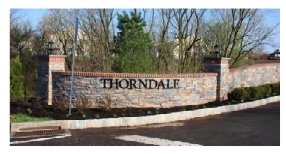
Freestanding signs for residential developments containing more than 10 units are permitted up to 15 square feet in area and 8 feet in beight..