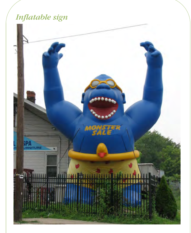
Incidental Window Sign

Inflatable Sign: A sign that is an air-inflated object, which may be of various shapes, made of flexible fabric, resting on the ground or structure and equipped with a portable blower motor that provides a constant flow of air into the device.