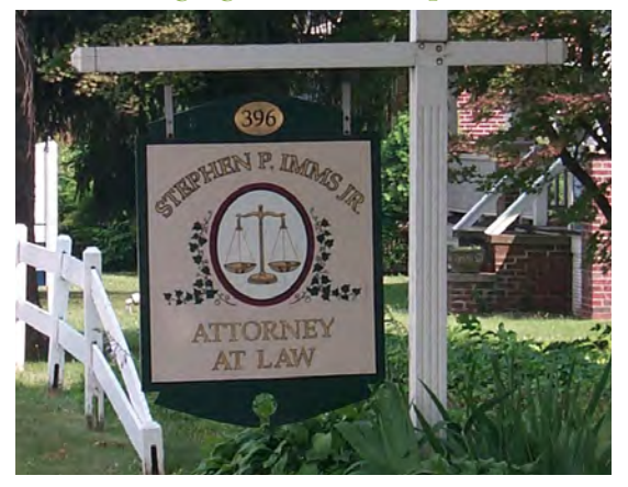
Freestanding signs for home occupations in residential districts are permitted up to 6 square feet in area.