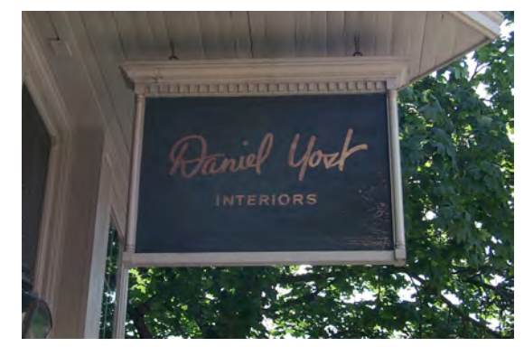
Projecting or wall signs for home occupations in residential districts are permitted up to 2 square feet in area.