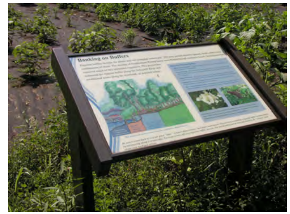
A freestanding sign is permitted at each entrance to a park or open space facility, subject to area and height limits. Additional smaller signs that are located interior to the site, and are not intended to be viewed from outside the property, are exempt from permit requirements, subject to area and height limits