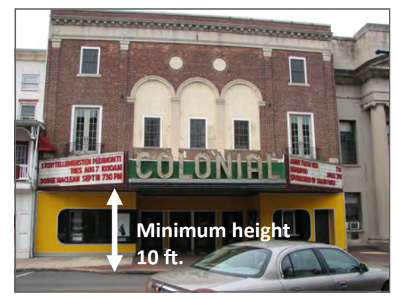
A minimum vertical clearance of 10 feet is required between the bottom of the marquee sign and the sidewalk.