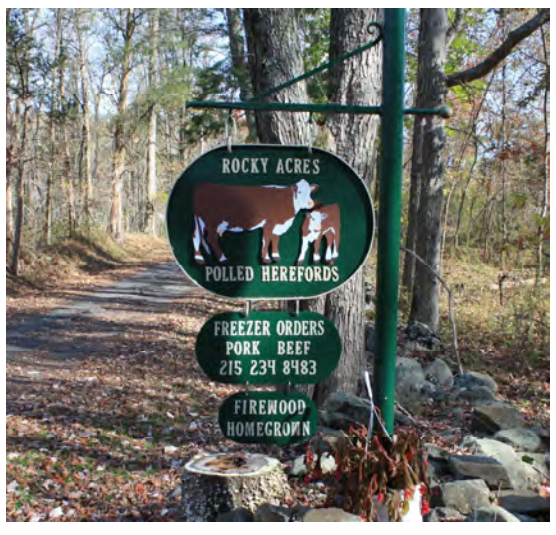
Freestanding signs for non-residential uses in a rural or agricultural district are permitted up to 20 square feet in area.