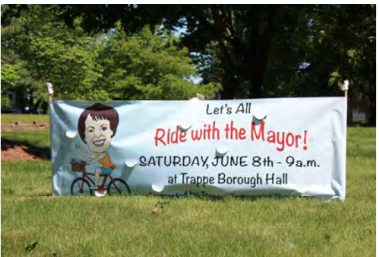
Banners, as defined in this ordinance, are only permitted as temporary signs and can therefore only be displayed for up to 30 consecutive days, twice per calendar year.