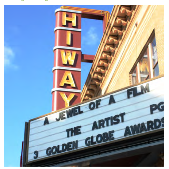
This marquee sign incorporates manual changeable copy to advertise upcoming shows. The portion of the sign saying "Hiway" would be considered a projecting sign.