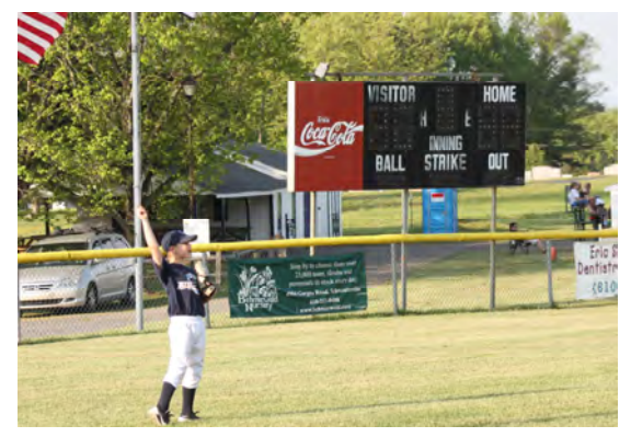
A scoreboard and signs located on the interior of the facility's fence are permitted for athletic fields subject to size, height, and illumination requirements.