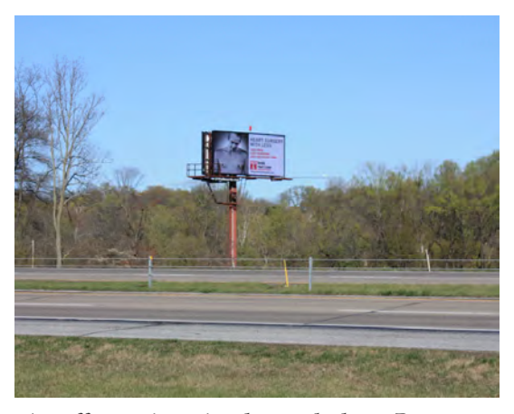
An off-premises sign located along Route 422, where the speed limit is 55 mph. A sign located along a roadway with a higher speed limit will need to be larger than those located where traffic moves slower.