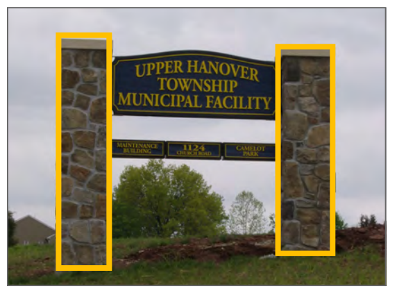
Example of a sign supporting structure on a freestanding ground sign. So long as the supporting structure does not contain any messaging, the sign supporting structure is not