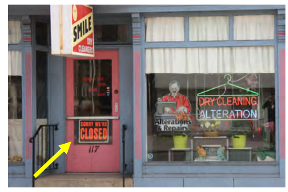
Examples of incidental window signs include signs that contain only the business' hours of operation, civic affiliations, or credit institutions accepted.