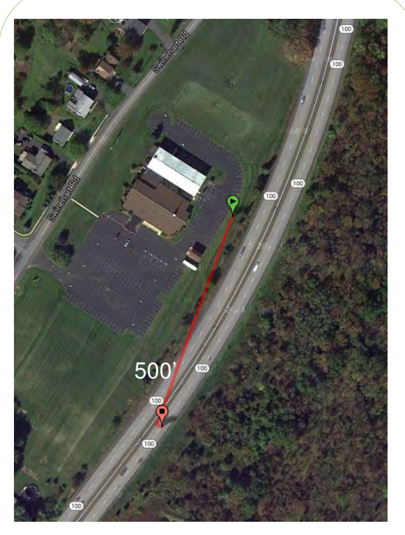
Example B: Posted Speed Limit of 55 MPH

5. Since the resulting amount of time (6.8 seconds) is less than 8 seconds, the minimum message duration for this particular sign is 8 seconds .