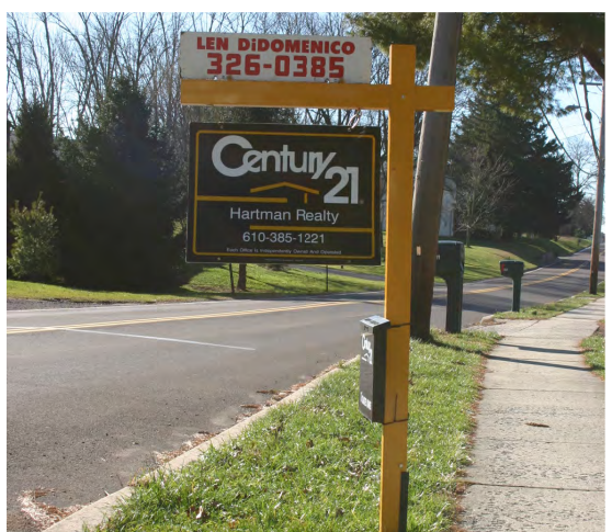
Limited duration signs are restricted by their size, height, and number permitted per property. Unlike temporary signs, limited duration signs do require a permit. The permit is valid for up to one year, and is renewable upon expiration.