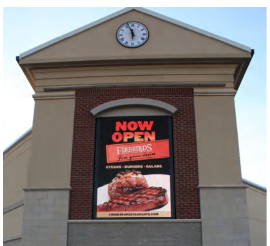
A minimum message duration for electronic signs and tri-vision boards helps minimize distractions to the driver and can improve the effectiveness of an advertisement by ensuring a message can be ready in its entirety by viewers.