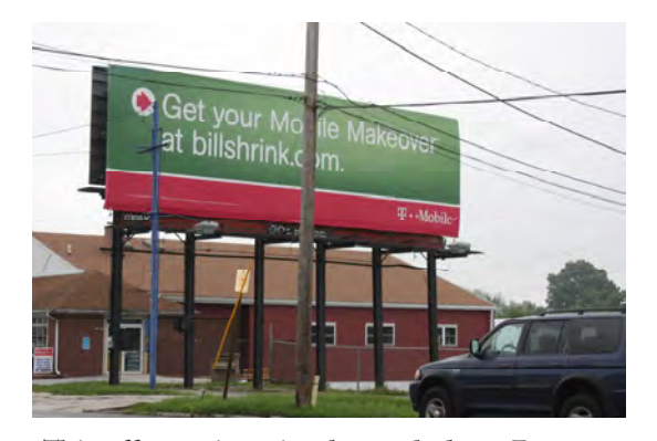
This off-premises sign located along East Main Street in Norristown is unnecessarily large for the adjacent roadway conditions, where traffic moves at a speed of only 35 mph.