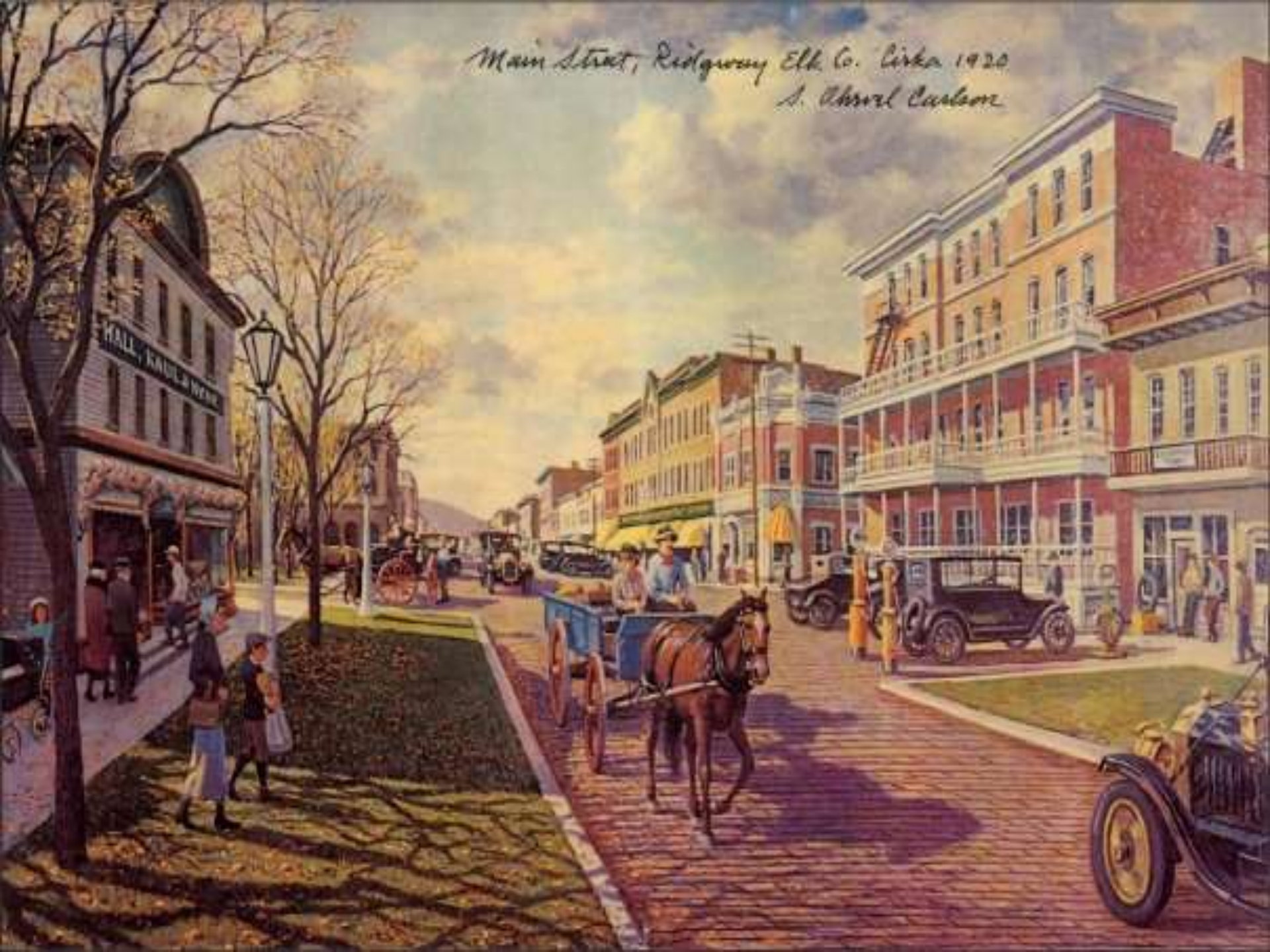
Main Street, Ridgeway Elk Co. Circa 1920