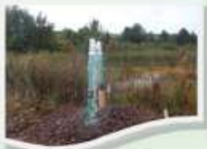
Mill Creek AMD Project, Jefferson County

Join us in an exciting new regional partnership program that will build good stewardship of our natural resources. We strive to provide protection to ensure their existence for future generations, while allowing for wise development that allows us to enjoy and benefit from their use.