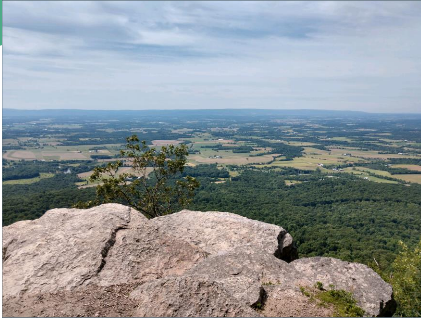
Current open space guidance