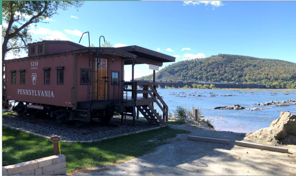
Cultural resource guidance