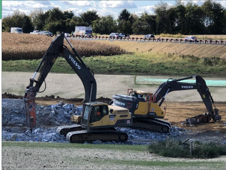
Current land development guidance