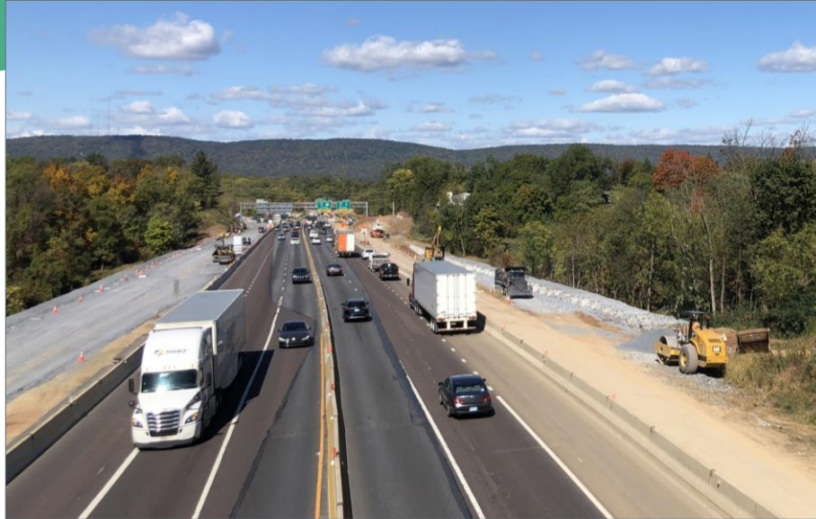
Current infrastructure guidance