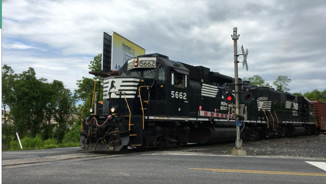
Current transportation guidance