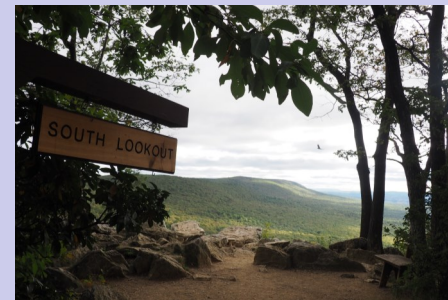
Hawk Mountain's South Lookout beckons...

Planners who complete the training will have the ability to write land use regulations that manage growth and conserve land. This is accomplished through the training, noted above, as well as with model land use regulations already tested in PA and proved to conserve land through the residential development process. Planners will leave the workshop with an understanding of zoning and subdivision / land development ordinance standards essential to producing conservation subdivisions.