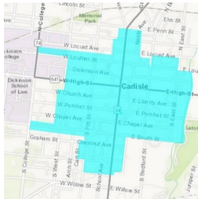
Exhibit 2: Carlisle Historic District (National Register of Historic Places [NR])