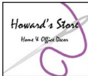
New sign on existing frame