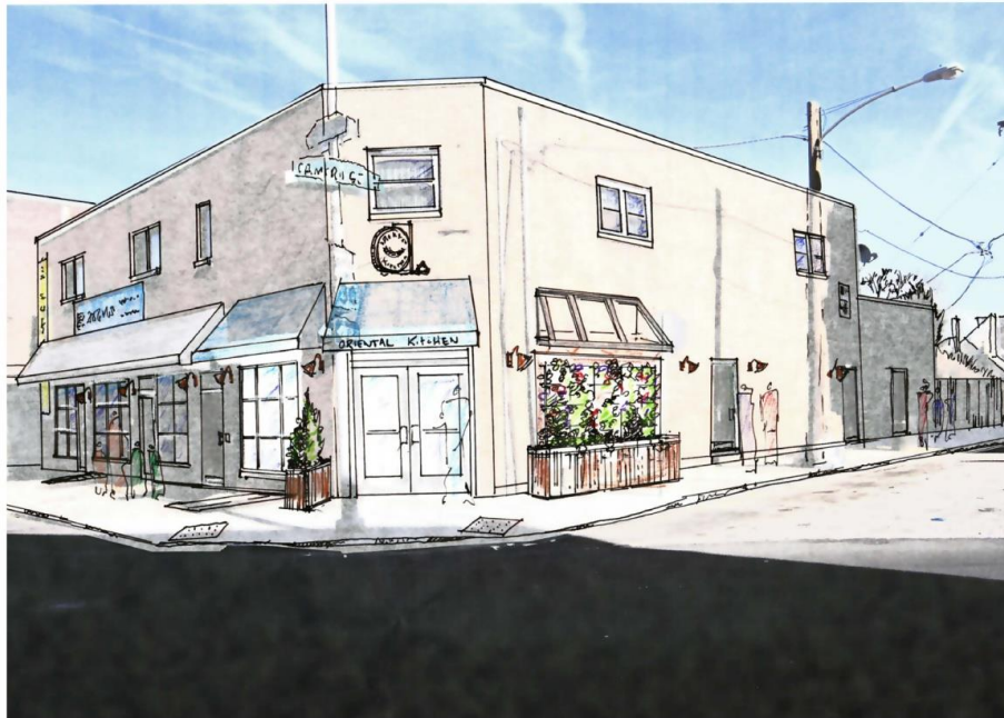
2 RECOMMENDED IMPROVEMENTS