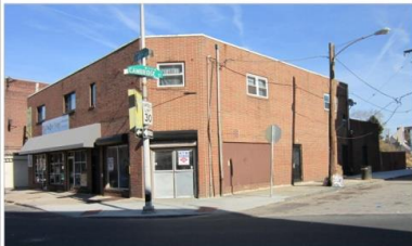
1 EXISTING CONDITIONS