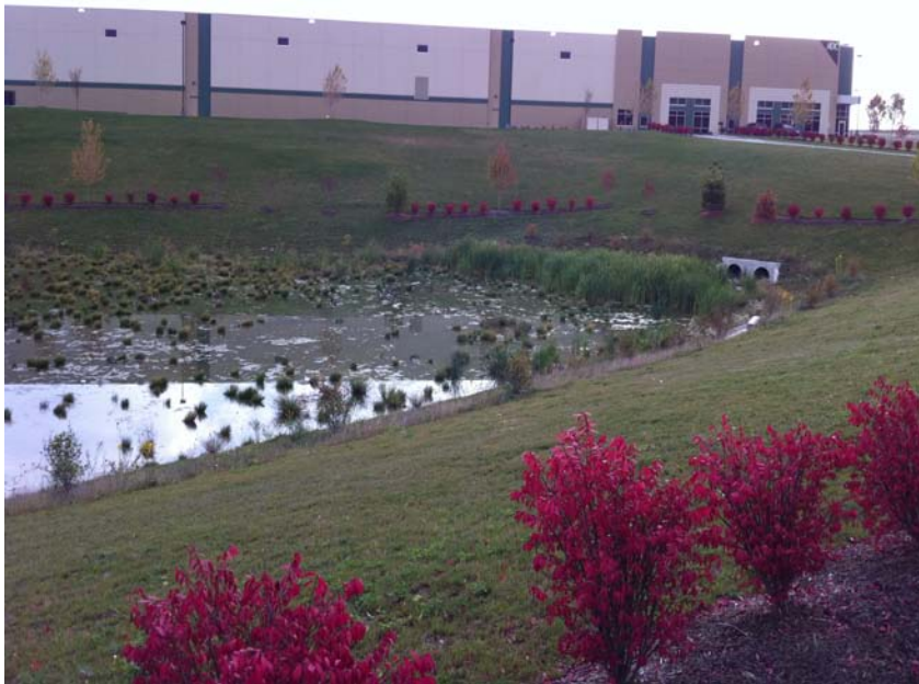
Post Construction Storm Water Management Basin