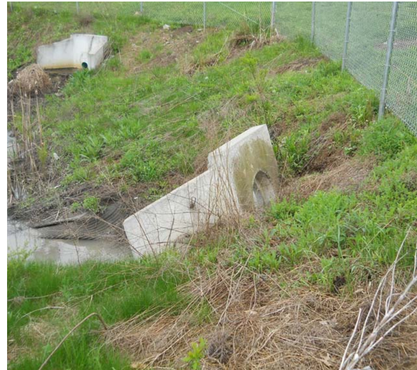
Poor endwall construction