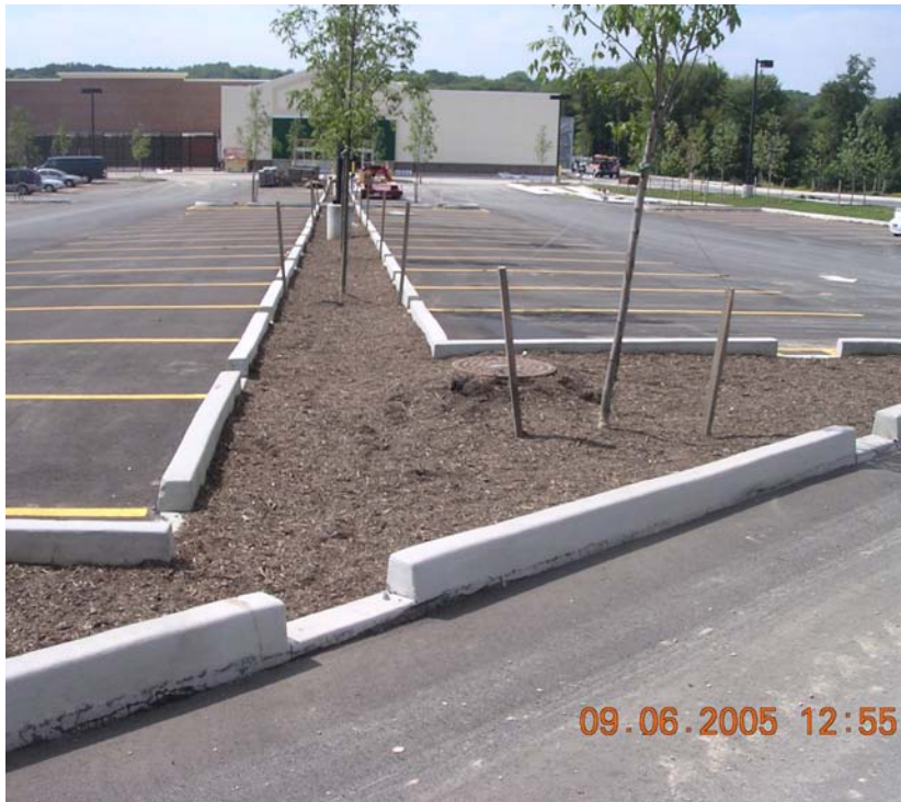
Curb cuts on low side of bio-filtration area