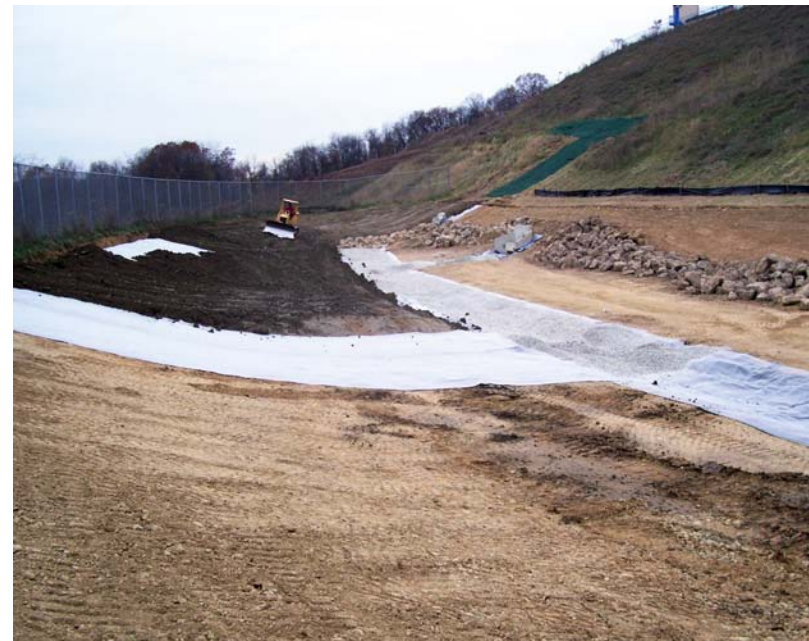
Detention Pond Reconstruction