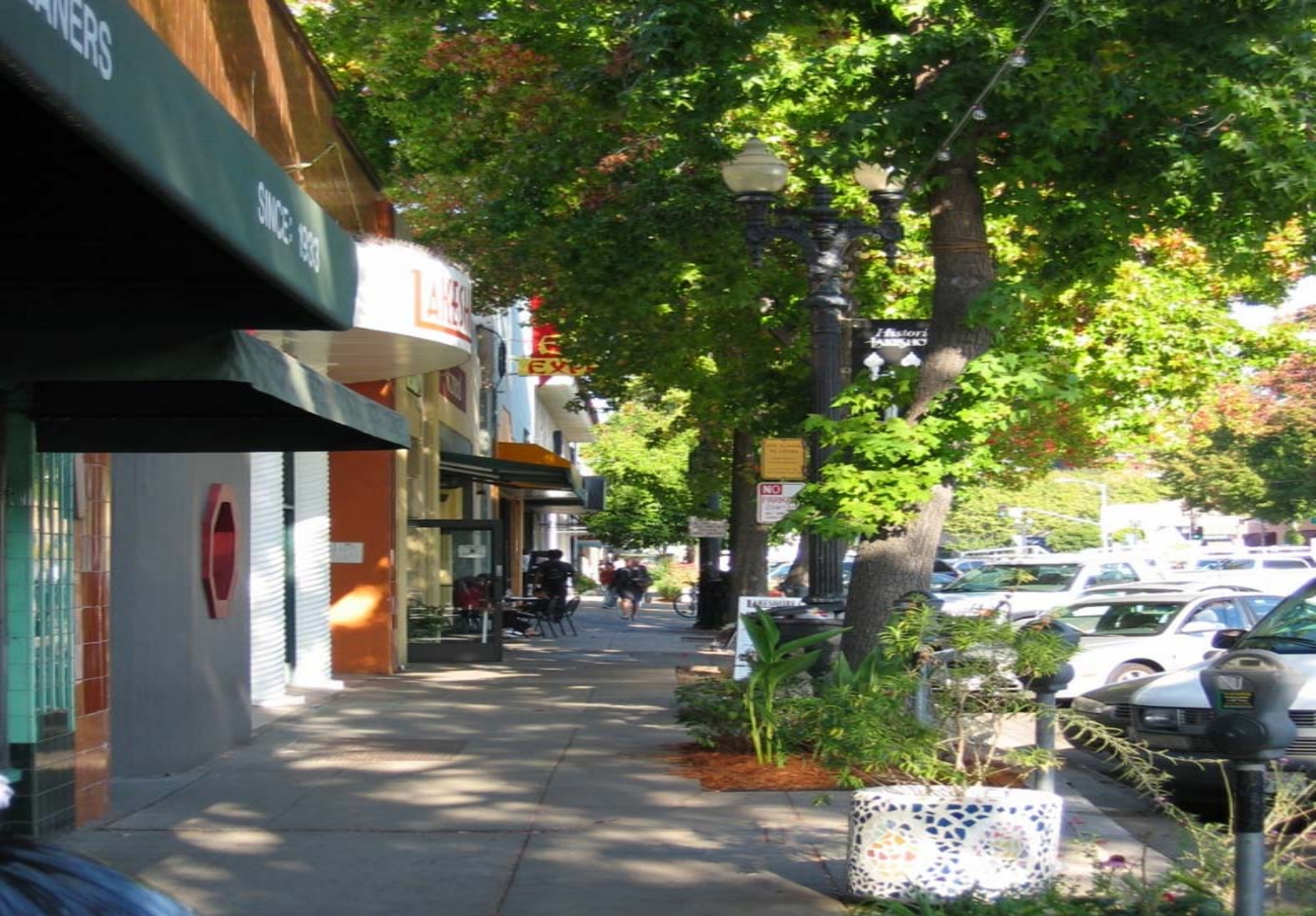
LAKESHORE DISTRICT | Oakland, CA | 2004