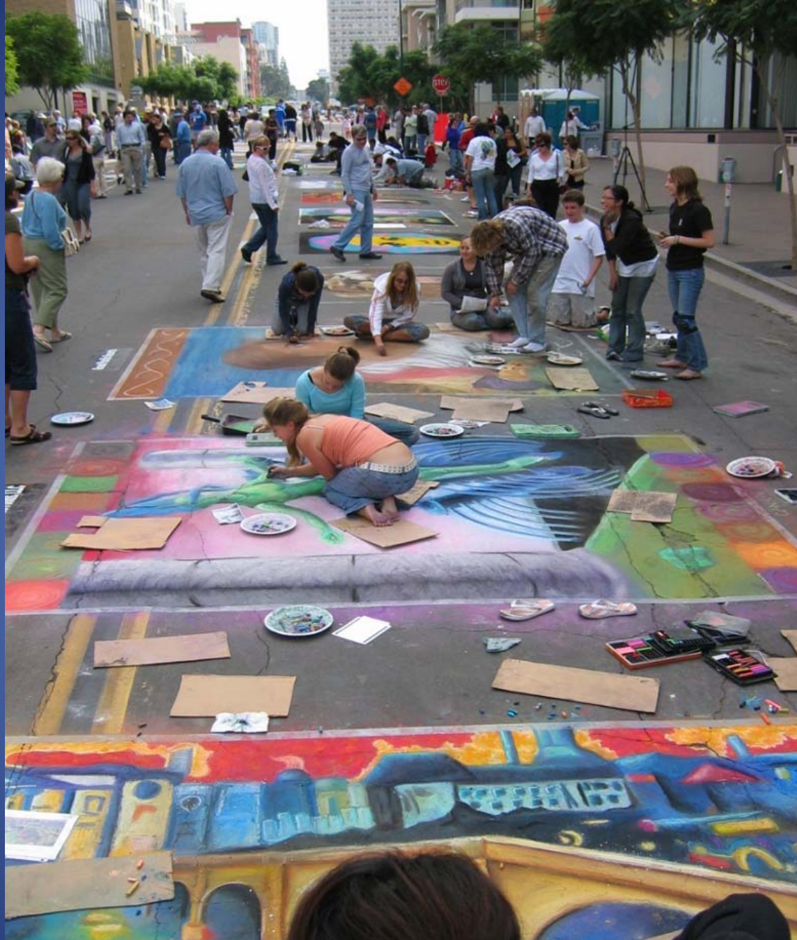
LITTLE ITALY FESTA | San Diego, CA | 2006