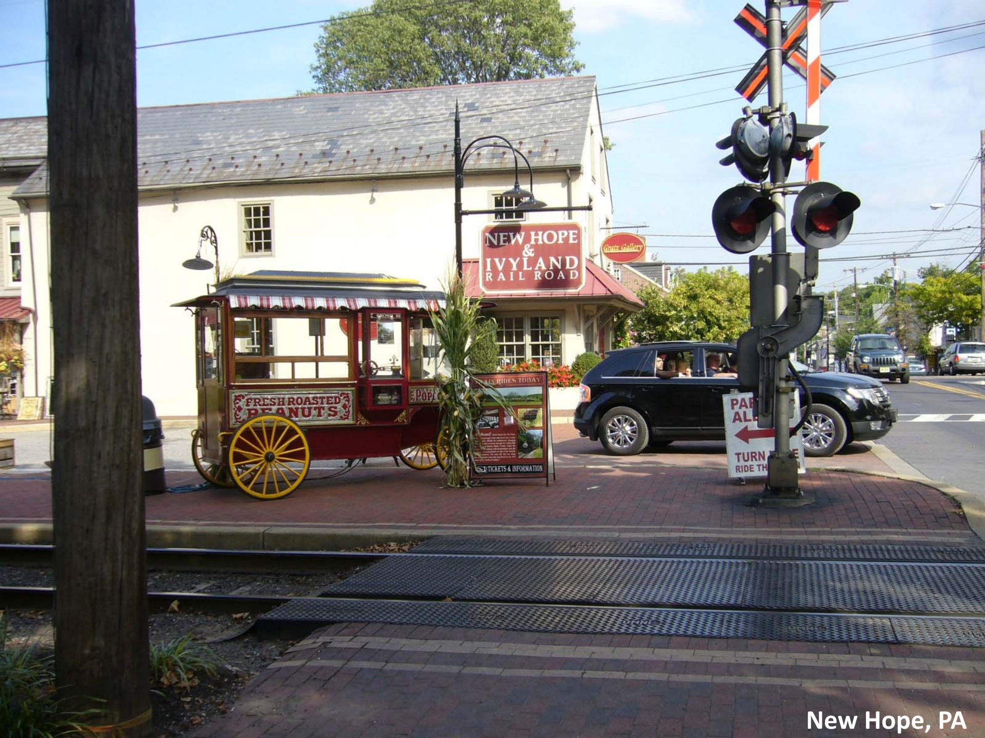
New Hope, PA