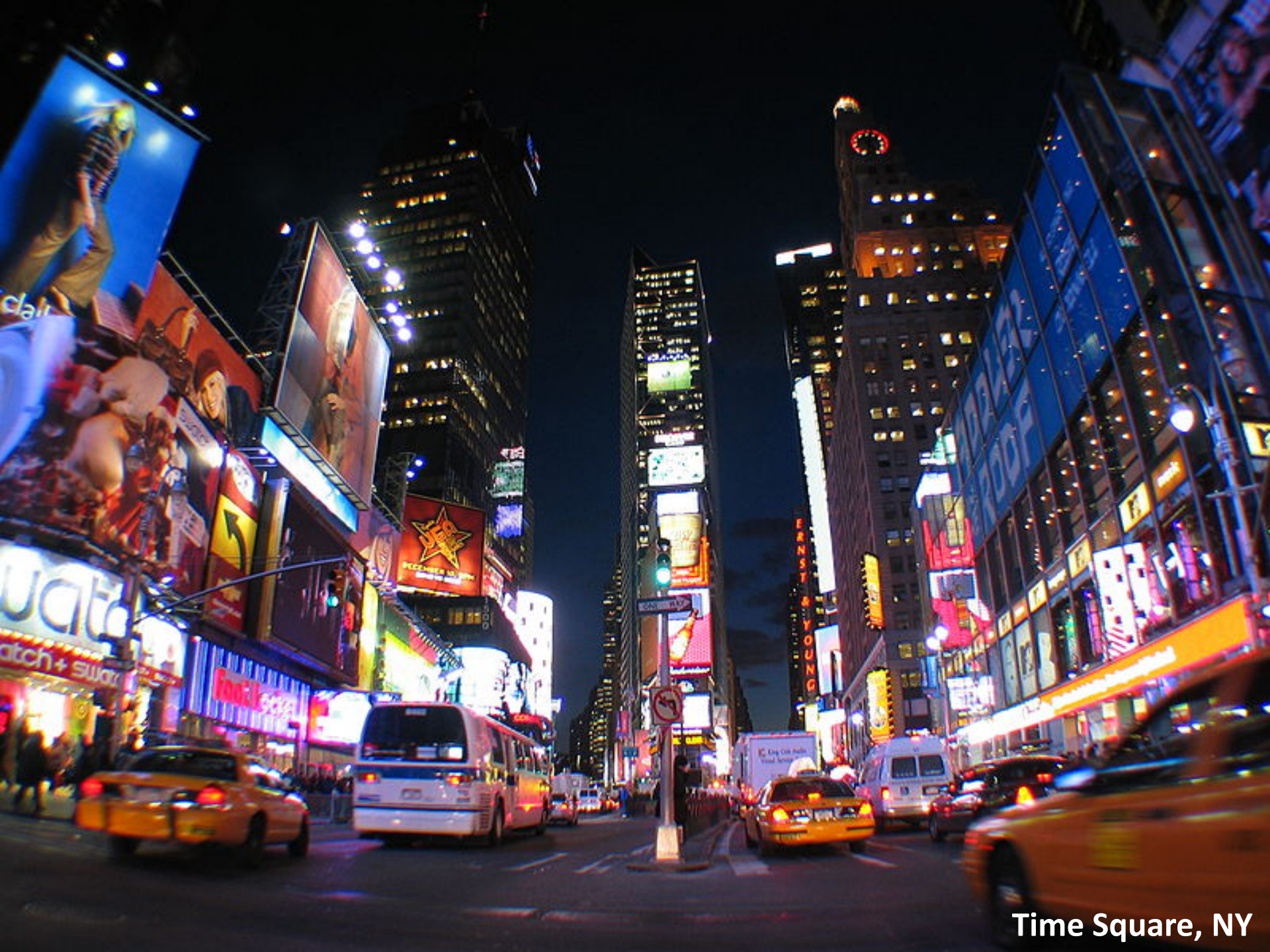
Time Square, NY