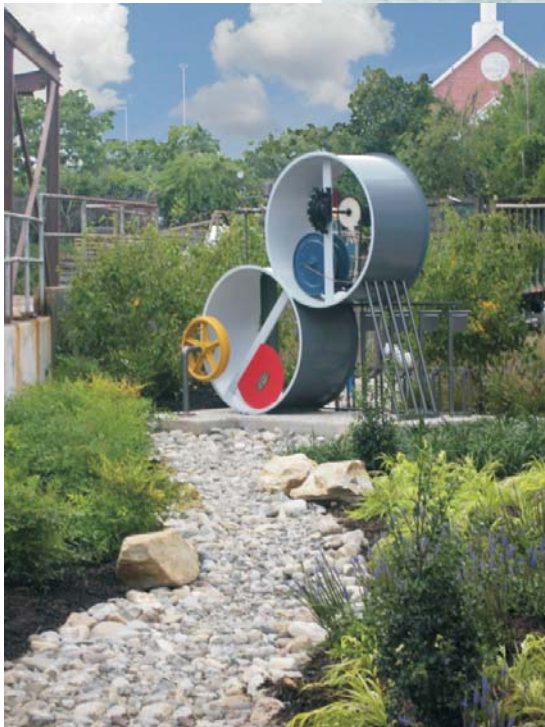
Campus Walk Sculpture Garden