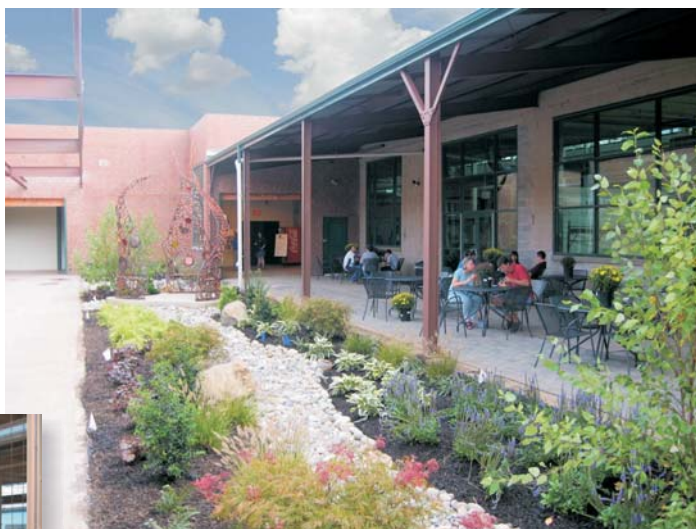
Campus Walk View East