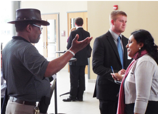
Conversations at IUP