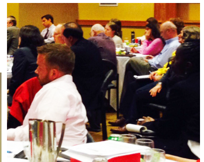
Lunch crowd in Allentown