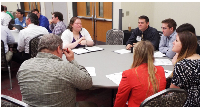
Group work at IUP