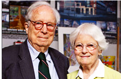
Robert Venturi and Denise Scott Brown Philadelphia, Pennsylvania