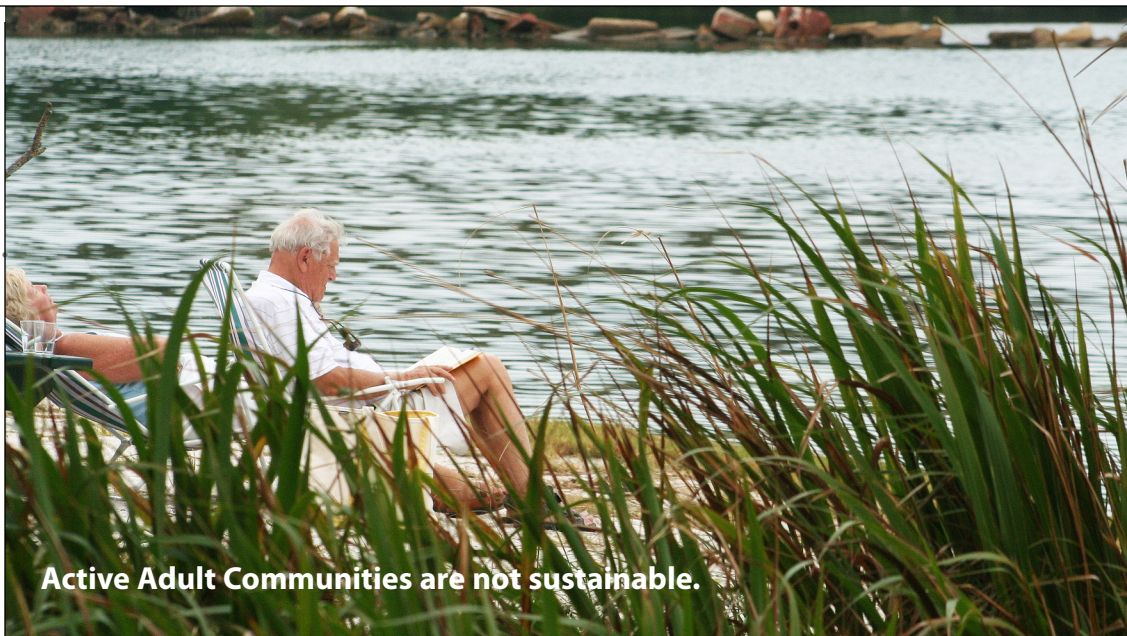
Active Adult Communities are not sustainable.

Grocery stores are one of the most important businesses that should be considered and getting to these stores should be accessible by foot. The planning issue is that many zoning and subdivision/land development ordinances have buffer requirements between residential and non-residential uses. If a buffer requirement separates the community