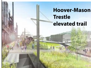
Hoover-Mason Trestle elevated trail

Stay tuned for the dates of these exciting events.