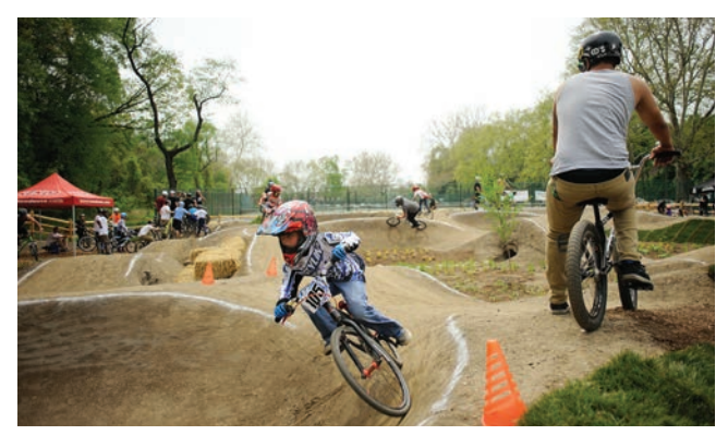
Bicyclists at the opening day of the Philly Pumptrack at Parkside Evans, dedicated in the spring of 2014.