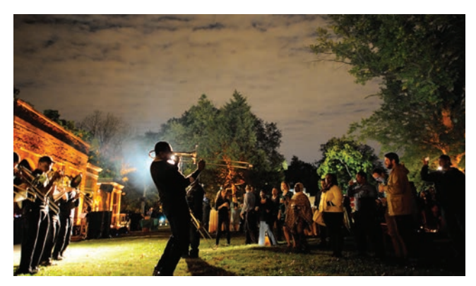
Musicians entertaining the crowd at the 2014 GLOW in the Park, held that year outside the Strawberry Mansion Music Pavilion in East Fairmount Park.

For more information about APA's Great Public Spaces and Streets, visit www.planning.org/greatplaces. ◆