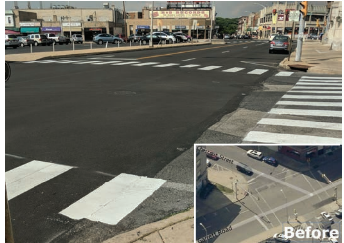
Chestnut Street Crosswalks

Sound planning efforts and close coordination with stakeholders can set a clear vision for a project and provide communities with the foundation to take advantage of opportunities as they arise. ♦