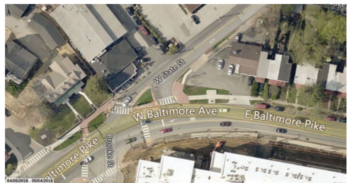
After Media West End