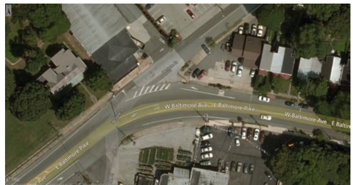
Before Media West End